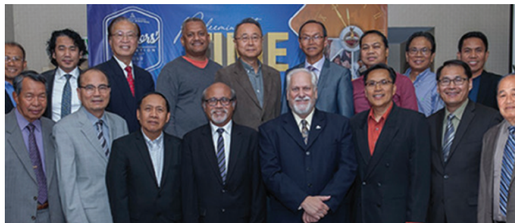
↓ Attendees at the 2019 NAD Asian-Pacific Pastors' Convention Provided by the Pacific Union Conference

—Faith Hoyt, with NAD Office of Communication