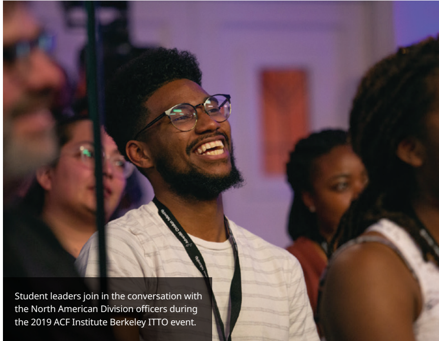
Student leaders join in the conversation with the North American Division officers during the 2019 ACF Institute Berkeley ITTO event.

“Number one, you are needed in the church; your ideas are needed,”