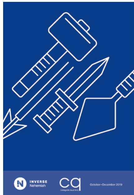
↑ The journal cover for the new Sabbath School Bible Study guide for collegiates.